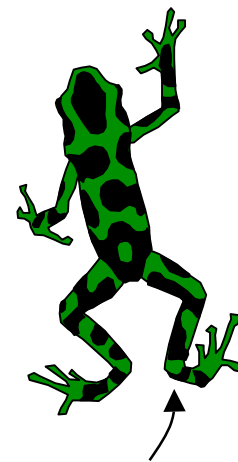
Finished product using fusible web appliqué

A, B, C, D, E & G = Green F, H - cc = Black